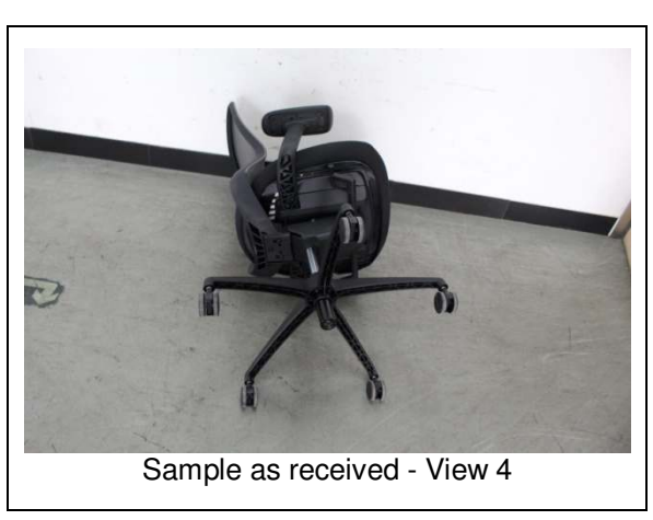
SGS authenticate the photo on original report only ***End of Report***